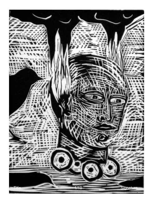
On a bleed print you can sign on the bottom front, using graphite pencil or a white pencil