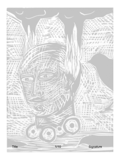
Or you can sign it on the backside in graphite.